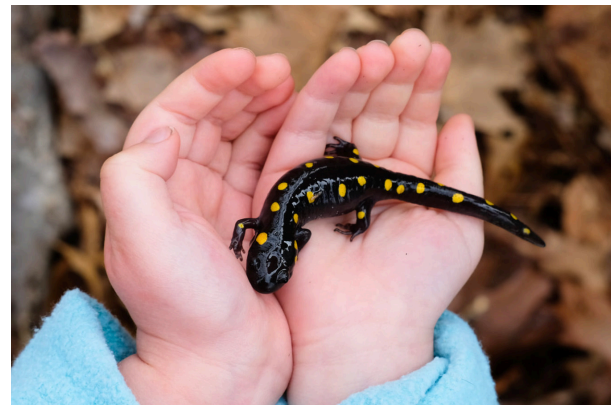
Pictured: Wood frog egg mass and yellow-spotted salamander.