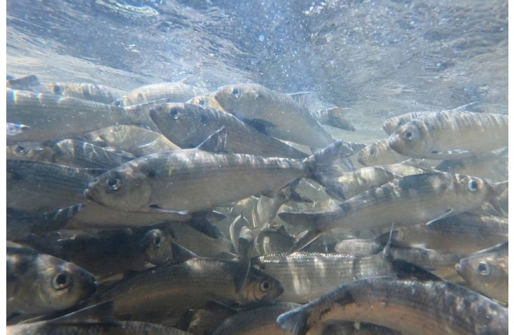
Mill Brook Alewife Migration

Each field season brings trail maintenance projects at each of our 16 public access preserves. If you want to spend more time outside while doing challenging and meaningful work for the community, this is for you. No prior skills are needed, and we will provide all necessary tools and equipment. Hours are flexible.