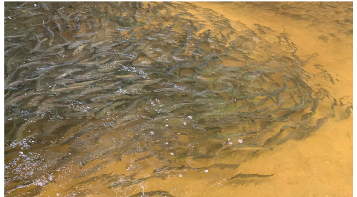
Mill Brook Alewives Schooling