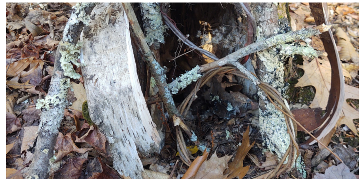
Mill Brook Preserve Fairy and Gnome Home

The Land Trust is excited to announce a collaboration with the United Way of Greater Portland and Brick and Beam, a local non-profit, on a Story Walk along the towpath and river at our Hawkes Preserve. What could be better than reading a story outside while enjoying fresh air and the beautiful scenery of the Presumpscot River? The first Story will be posted on our website later this spring, and it will be the subject of our June outreach event.