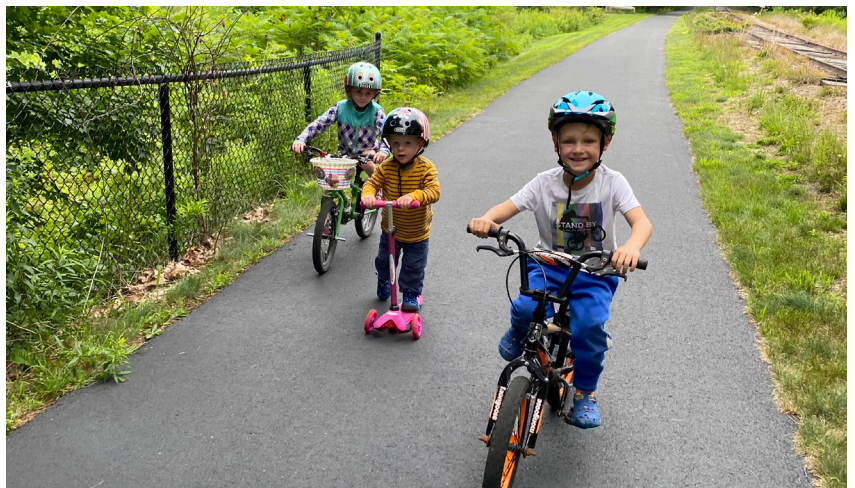
Sebago to the Sea Trail

All events are free, but space is limited, and RSVP is required. To learn more about these events and to RSVP, go to our website www.prlt.org or call 839-4633.