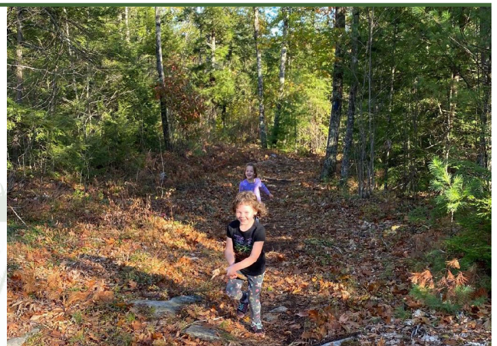
Pride Preserve, Westbrook

Planned gifts come in all sizes, and each is an expression of a person's desire to make a difference and leave a lasting legacy. A bequest is the most common way to make a planned gift. You can donate a specific amount or a percentage of your assets in your will, or make a donation of land to our Land Trust.