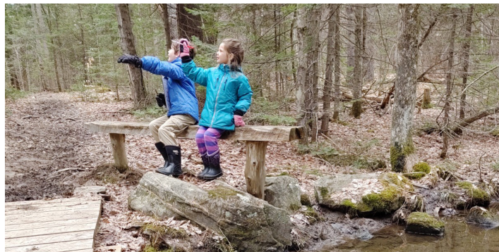
Black Brook Preserve

The scavenger hunt and fairy and gnome village will be permanently maintained, and you will see them both on updated maps of the Preserve. Our May event will be a weeklong independent event highlighting these new features at Black Brook Preserve.