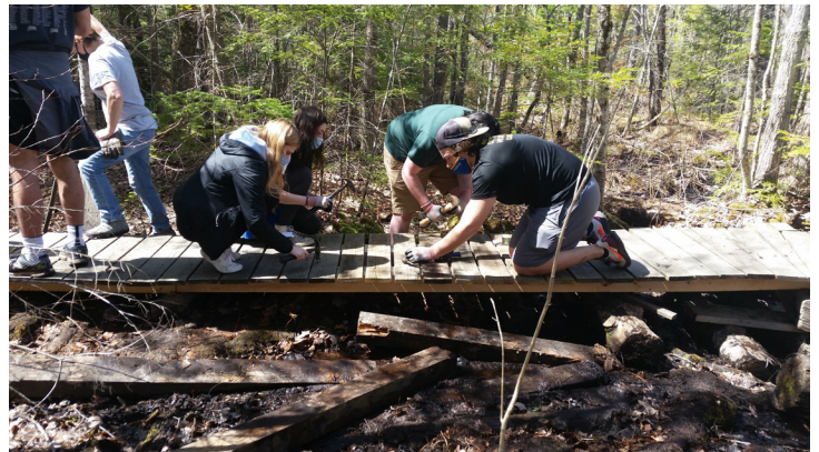
Frazier Preserve Trailwork Volunteers

LEARN MORE AND SIGN UP FOR ANY OF THESE VOLUNTEER OPPORTUNITIES AT