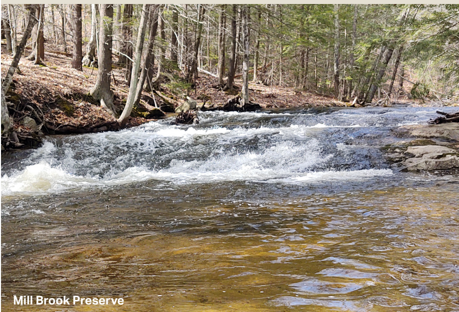
Mill Brook Preserve

The improvements are made possible by the Maine Land Trust Network Covid Relief Grant, Westbrook Recreation and Conservation Commission, Cornelia Warren Community Association, Business Partners, and Land Trust Member Support.