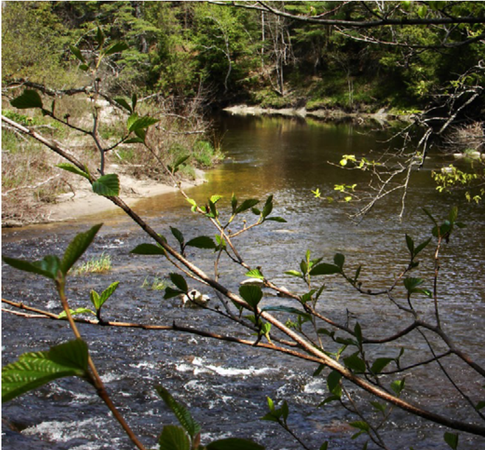
Little River Preserve in Gorham

As I look back on all the impressive accomplishments Presumpscot Regional Land Trust has had in the past 30 years, three stand out most. Someone else might choose differently, but to me these moments represent our growth, our expanding understanding of what it means to be a land trust, and perseverance in the face of disappointment and difficulty. With that preamble, they are: