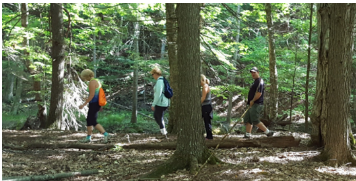
Mill Brook Preserve fall preview hike

To learn more about these events and RSVP go to our website www.prlt.org or call 839-4633.