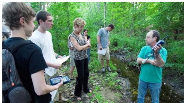
Presumpscot River Watch training

In 1994, while continuing to conduct ongoing water quality monitoring, Presumpscot River Watch also published a seminal compendium on the cultural and natural history of the Presumpscot River. The Presumpscot River Watch Guide to the Presumpscot River: Its History, Ecology, and Recreational Uses , has been an indispensable reference for anyone interested in learning more about the rich and varied history of the river (this publication is available at local libraries).