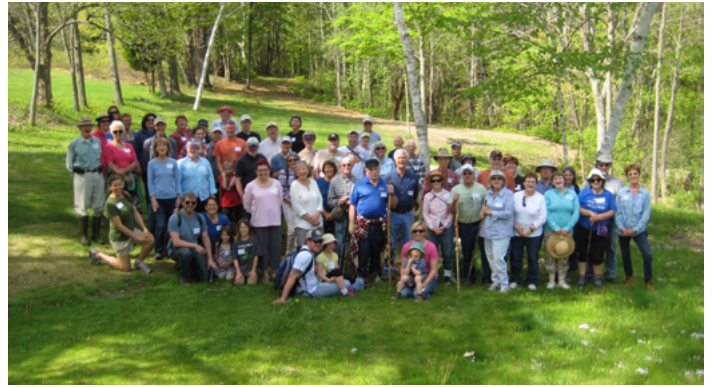
World Fish Migration Day Hike in Mill Brook Preserve May 2016