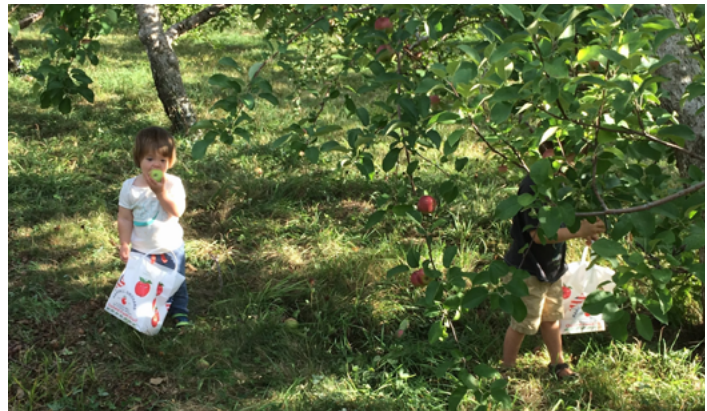
Randall Orchards in Standish

RANDALL FARM and PRESERVE. To bring this project over the finish line we had to work with a number of other groups and agencies, both State and Federal, and to navigate the Land for Maine's Future program. Money raising was a major challenge. Now, we are proud to have 500 acres conserved, with over 300 of them as local sustainable agriculture. It represents our largest conservation undertaking so far.