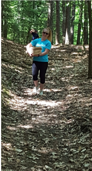
IDEXX volunteers building trails in Mill Brook Preserve

Our main stewardship priority this field season has been building trails at Mill Brook Preserve--that goal is now within sight with a grand opening coming soon. The Preserve consists of three miles of trail with a trail-head at Allen Knight Road (off of Methodist Road) in Westbrook. The trail is one of the longest and most beautiful hikes in the Greater Portland area.