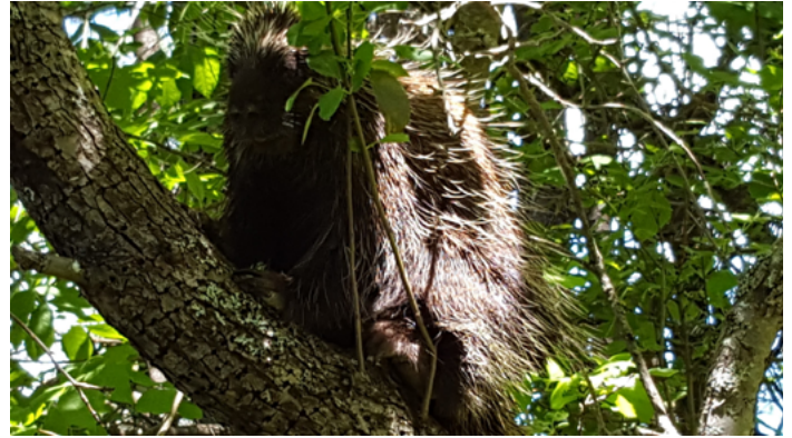
Porcupine seen by volunteers in Mill Brook Preserve

a wide variety of wildlife. On a given visit, you might see blue heron, bald eagles, porcupines, or one of many other bird and mammal species. From late May to early June, the waters of the brook will be swimming with alewives, migrating from the ocean back to their spawning grounds at Highland Lake. Several spots along the trail offer an up close view of this migration as the fish climb the stream rapids one by one.