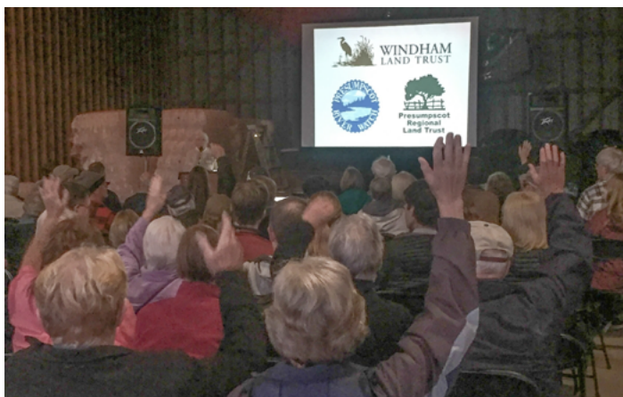
Windham Land Trust voting for the merger