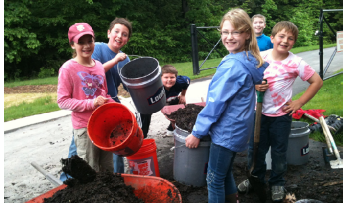
Students helping to build the Hawkes Preserve trail

We are thrilled to have an opportunity to expose these young people to nature at an early age.