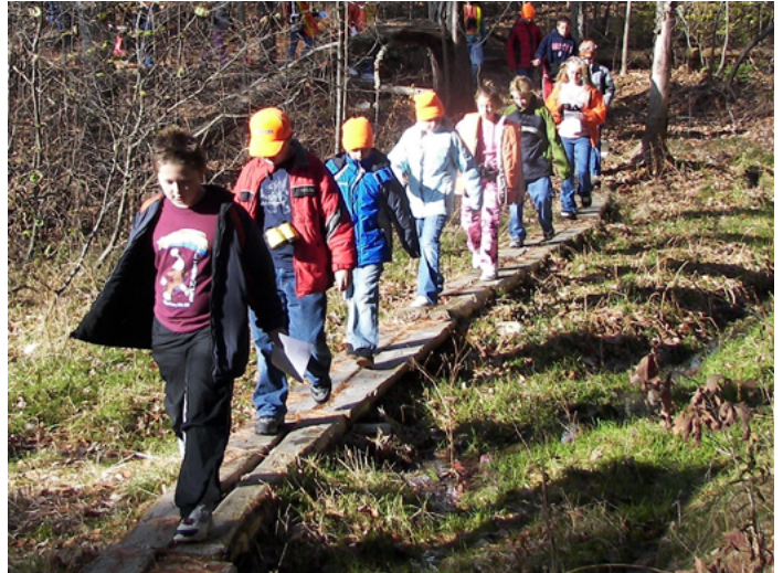
Windham fourth graders visiting Black Brook Preserve

Since 2012, this has also included monitoring water quality of the brooks that run through our preserves. Windham Land Trust has accepted donations of various types of undeveloped lands including fields, wetlands and woodlands either through outright donations or through conservation easements. Windham Land Trust has also worked with Maine Farmland trust to help preserve agricultural land, including the 80-plus-acre Weeks farm in Windham.