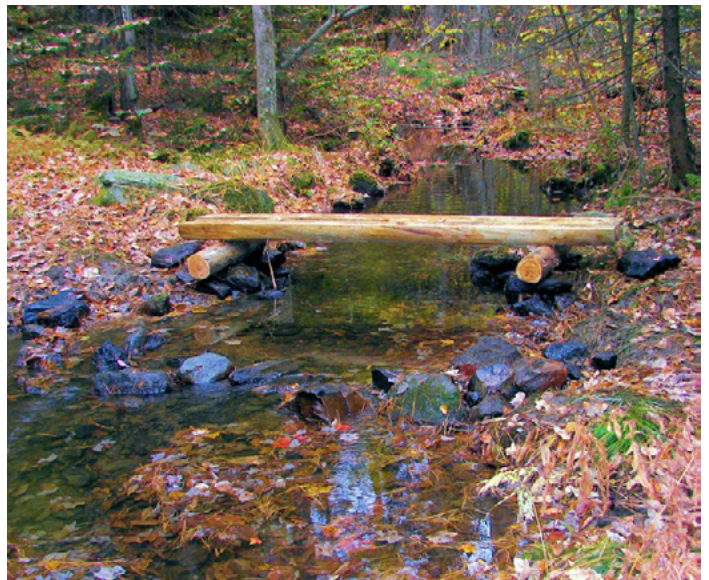
Black Brook Preserve

In 2003, Jack Dunham donated the 63-acre Frog Hollow Farm located on Winslow Road in Gorham. This beautiful piece of land is used for hiking, fishing, and hunting with written permission. This Preserve has two small ponds, a variety of apple trees, and is home to recently planted American Chestnut trees.