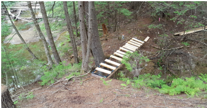
Bridge being built in Mill Brook Preserve

We can't wait to open the Preserve up to visitors of all ages in all seasons. In addition to a scenic backdrop for a hike, the Preserve offers an amazing opportunity to see