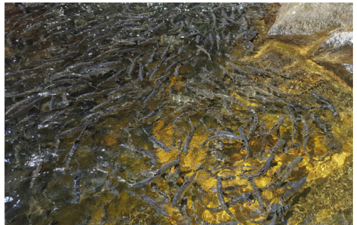
Thousands of migratory alewife swimming up Mill Brook

a wide variety of wildlife. On a given visit, you might see blue heron, bald eagles, porcupines, or one of many other bird and mammal species. From late May to early June, the waters of the brook will be swimming with alewives, migrating from the ocean back to their spawning grounds at Highland Lake. Several spots along the trail offer an up close view of this migration as the fish climb the stream rapids one by one.